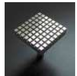
Example of SEST-GRID

Stand-off diameter is between 30% to 40% of ØF or TW but to a max. of 0.5mm. No Stand-off Pin for ØF <= 0.150mm.