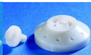
TWO PIECE NOZZLE