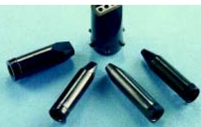
PICK & PLACE TOOLS